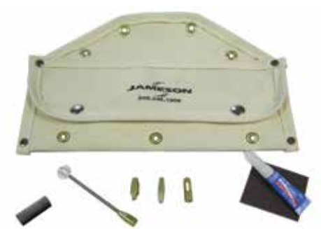
1/8" & 3/16" Mini Duct Hunter Accessory Kit