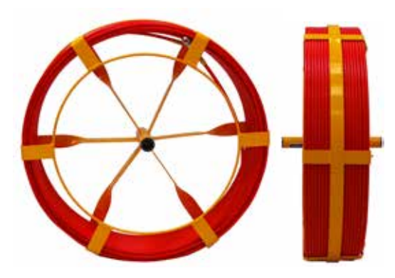
Duct Hunter Reel Replacement

However, on occasion it may be necessary to replace the entire spool of rod due to more severe damage. Removal, disposal and rod replacement can be a difficult and time-consuming task. Responding to customer feedback, Jameson introduced EZ-REEL™ pre-loaded replacement reels which help improve speed and safety of replacing damaged rod material.