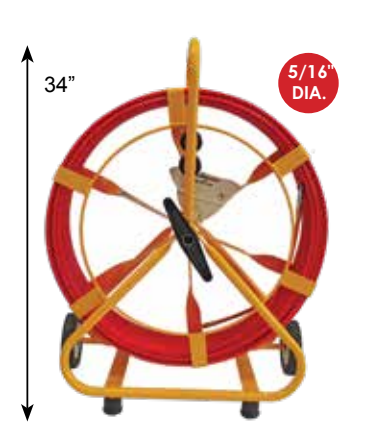
DUCT HUNTER™ 5/16"