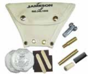
5/16 & 7/16" Duct Hunter Accessory Kit