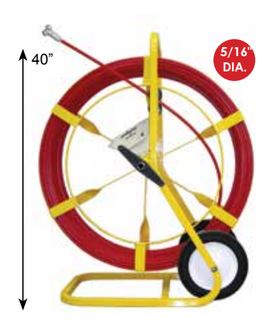
DUCT HUNTER™ 5/16"