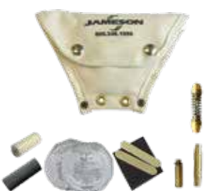
1/4" Duct Hunter Accessory Kit