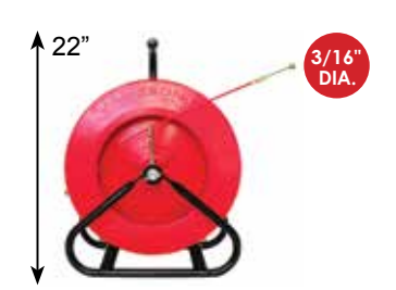
MINI DUCT HUNTER™ 3/16"