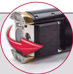
WIPERCAM PAN & TILT