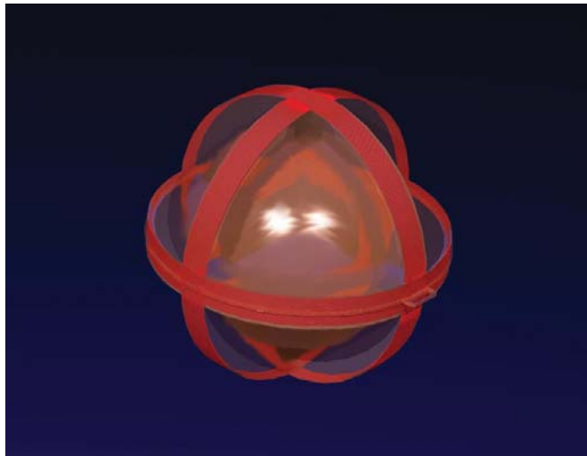
Omni Marker's patented three orthogonal circuits are what create the unique spherical field.

Range: 5 feet typical (1.5 meters) Field Type: Spherical Package Material: High-density polyethylene